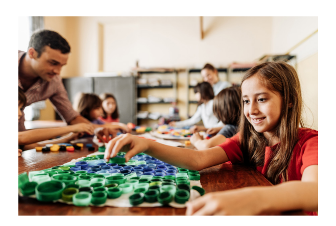
Will you start today?

You do not have to be currently suffering from a disaster to reap the rewards that will come from art-making. You also do not have to be an "artist" or a part of an arts organization to enjoy the wellness benefits that the arts offer. Broadening your definition of "art" beyond paintings on a wall will help you recognize that art is all around us. At any skill level, there are ways to inject beneficial creative practices into your daily routine.